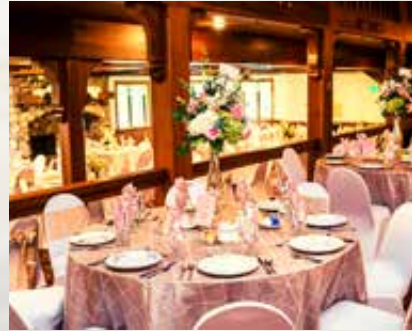
Table Setting Value Package:

Bone China Formal Table Setting Package per Guest $5.99 Includes: All Bone China Plates, Stainless Flatware setting, Dinner Glassware, Linen Napkin, Salt & Pepper Shaker Set, China Caddies for Sugar & Creamer